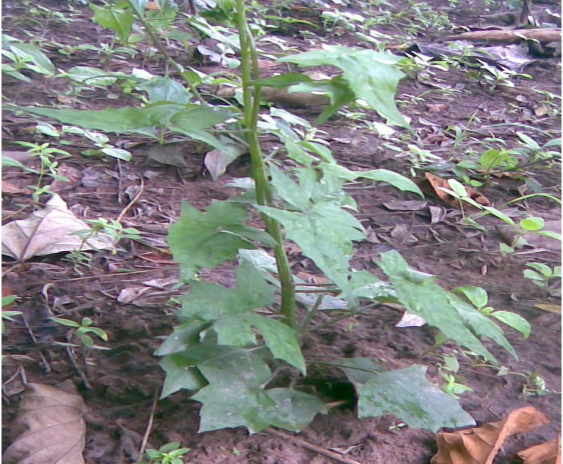
Plate 2.1: Senecio biafrae (Worowo) on the field, before staking