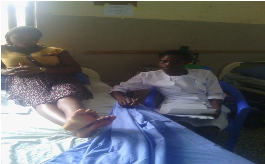
Student Demonstrating Health Education Skills