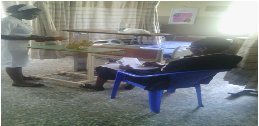
Student Demonstrating Basic Reproductive Health Skills