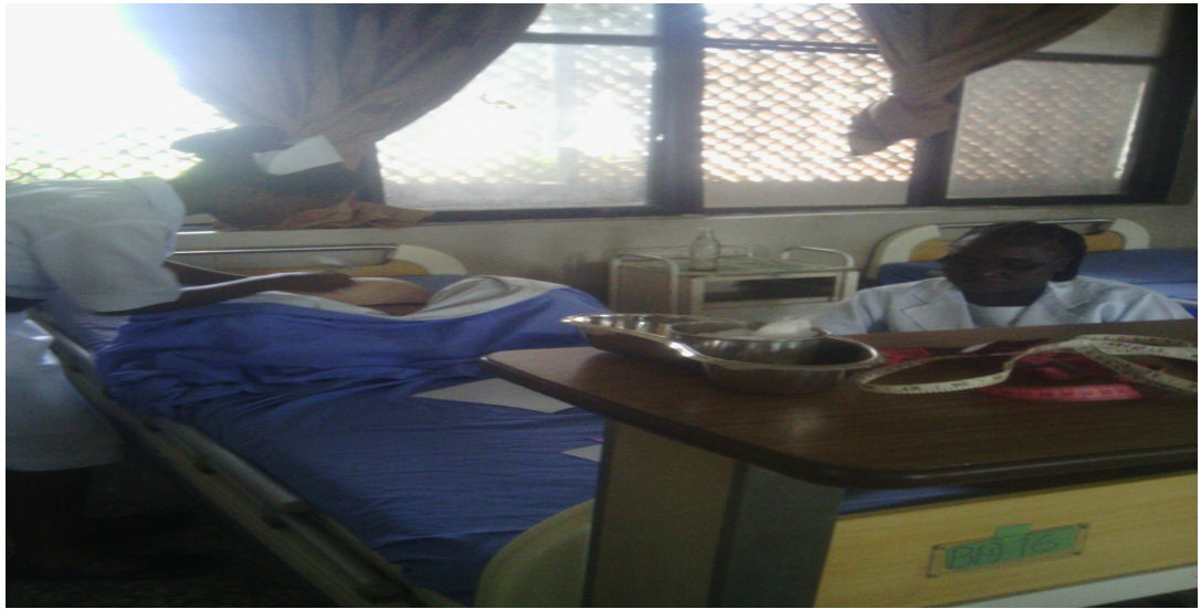
Student Demonstrating the Performance of Screening Procedure