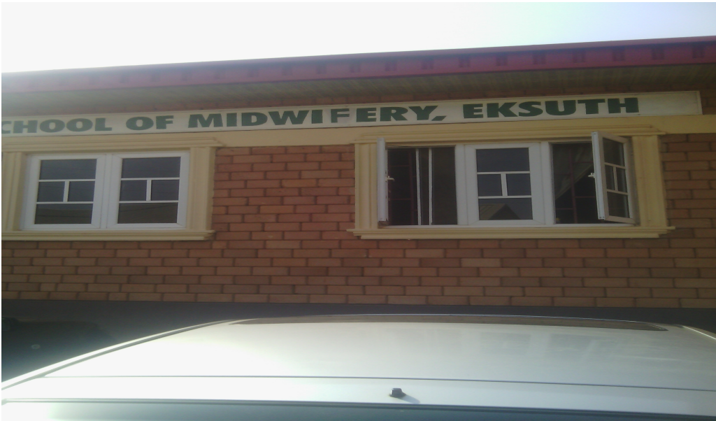
Picture Showing School Building