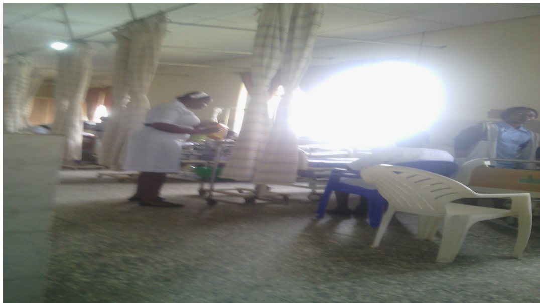
Student Demonstrating Family Planning Skills