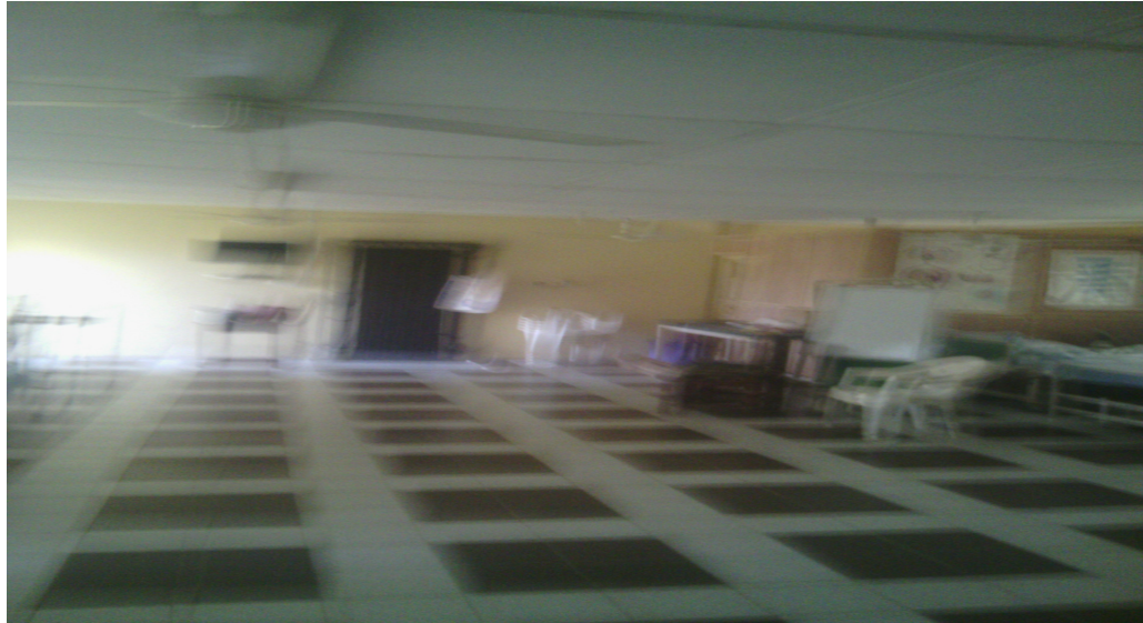
Picture Showing Practical Laboratory