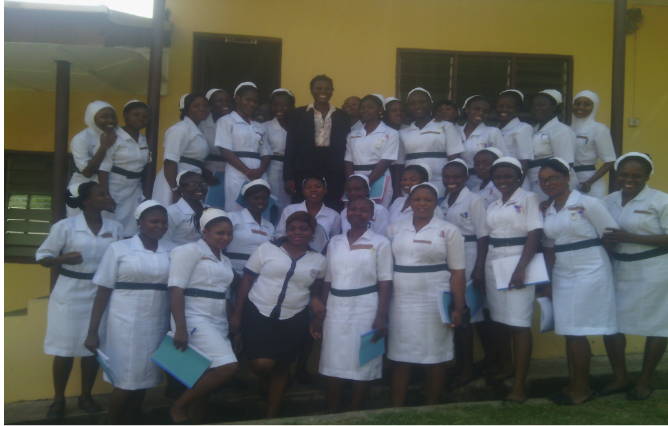
Researcher and Trainee Midwives