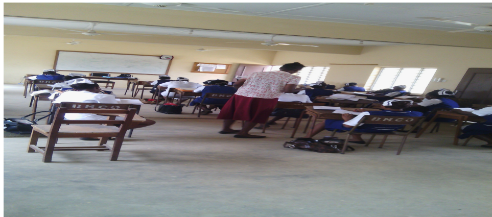
Picture Showing Students Writing Reproductive Health Test