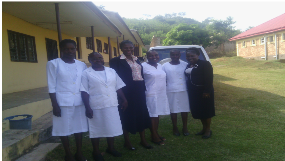
Researcher and Research Assistants