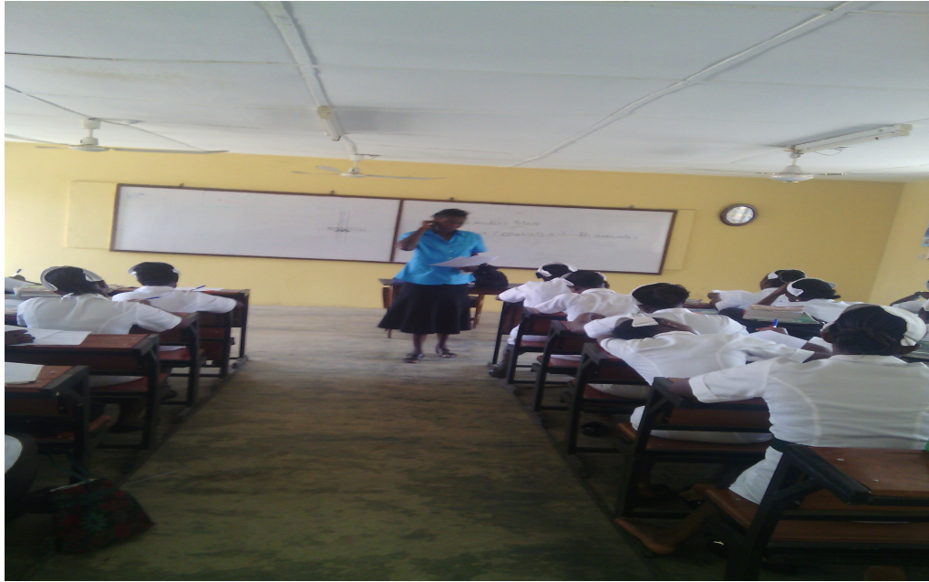
Picture Showing Researcher giving Instruction to the Students on the Questionnaire