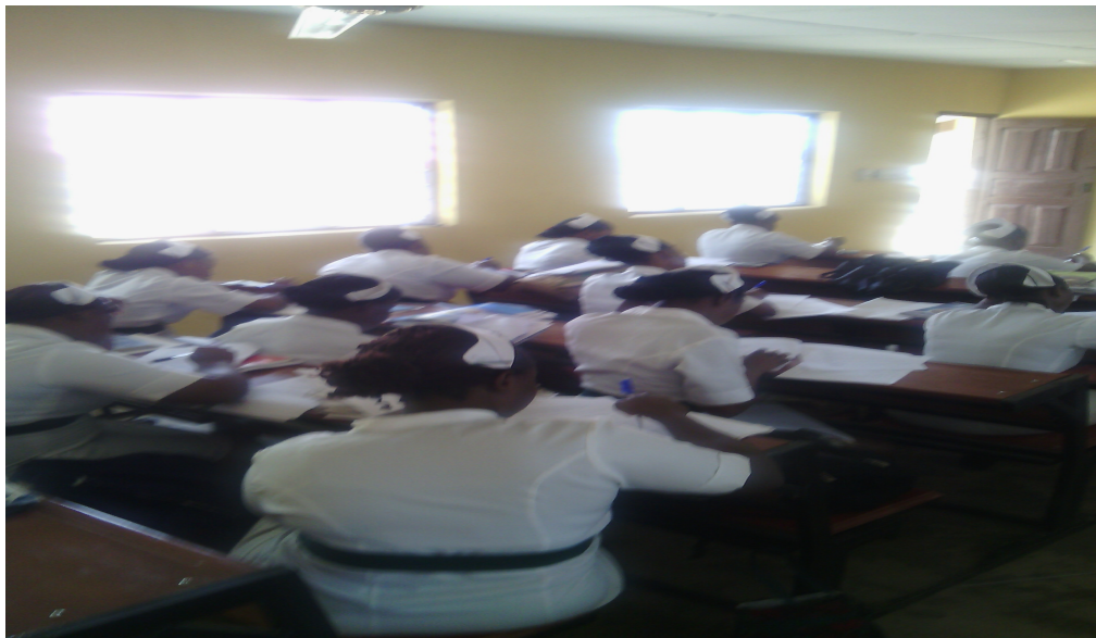
Picture Showing Filling of Questionnaire and Knowledge Test