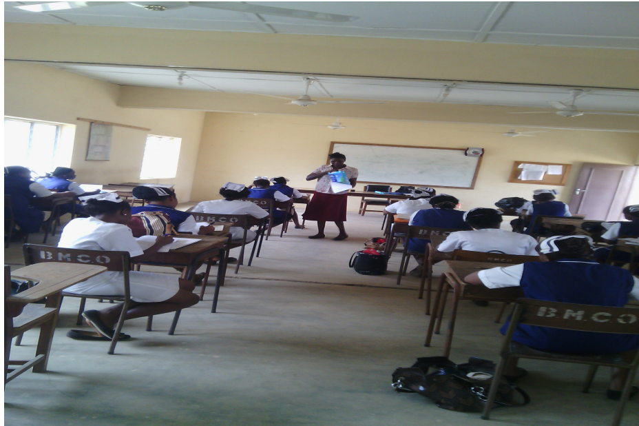
Picture Showing Students Filling the Questionnaire